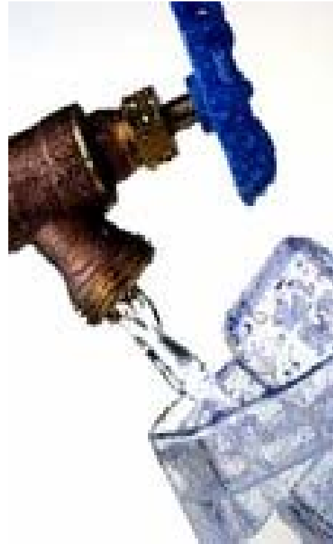
ANNUAL WATER QUALITY REPORT

DO NOT submerge a garden hose in buckets, pools, tubs or sinks and never attach chemical sprayers without a backflow device. A water main break or fire hydrant use, can cause a vacuum, sucking toxic chemicals into your household plumbing.