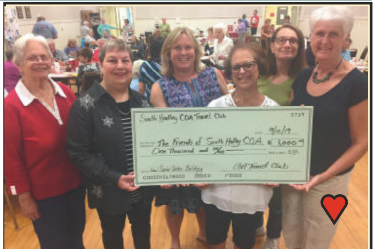
The COA Travel Club's $1,000 donation to the FRIENDS New Senior Center Building Fund