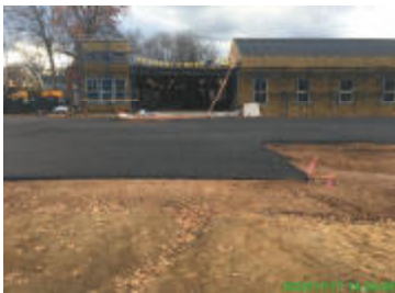
Photos of New Senior Center Progress: (Left to right) Library tower, front entrance, lobby and staff offices. (Pic #2)) Front entrance showing the library tower. (Pic #3) Back of building facing the Ball Field: Fitness Ctr, Exercise Studio, Billiards room and Creative Center. (Pic #4) Photo of the multipurpose room.

As we've done since the beginning of the pandemic, we will continue to waive the fees for our exercise programs in hopes that any concerns you have about covering the cost of the classes will not prevent you from joining in on the fun. So, here is your chance to fill the winter months with a list of exercise programs like Seated and Standing