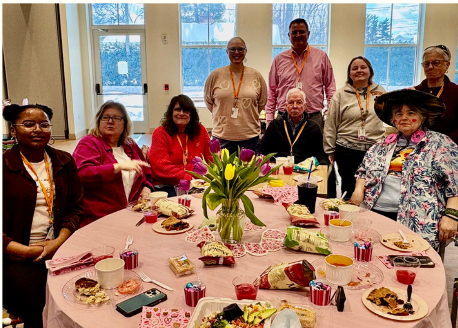
The Friends of the Senior Center generously brought lunch for the Council on Aging staff for Valentine's Day.