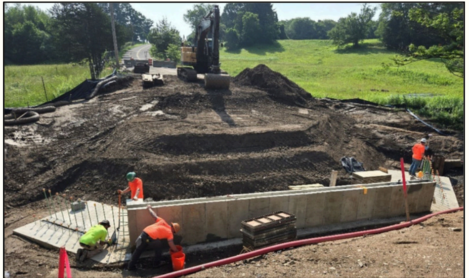
Throughout June, backfill was installed and concrete was poured into forms for a pedestal wall at the Pearl Street Culvert Replacement Project.