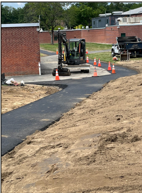
The new ADA pathway at SHHS is nearing completion. It provides an accessible route to the turf field.