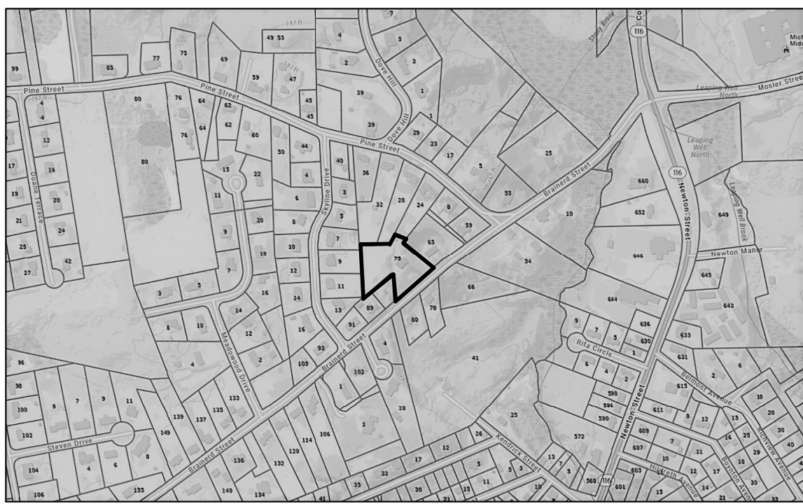
LOCUS (NOT TO SCALE)