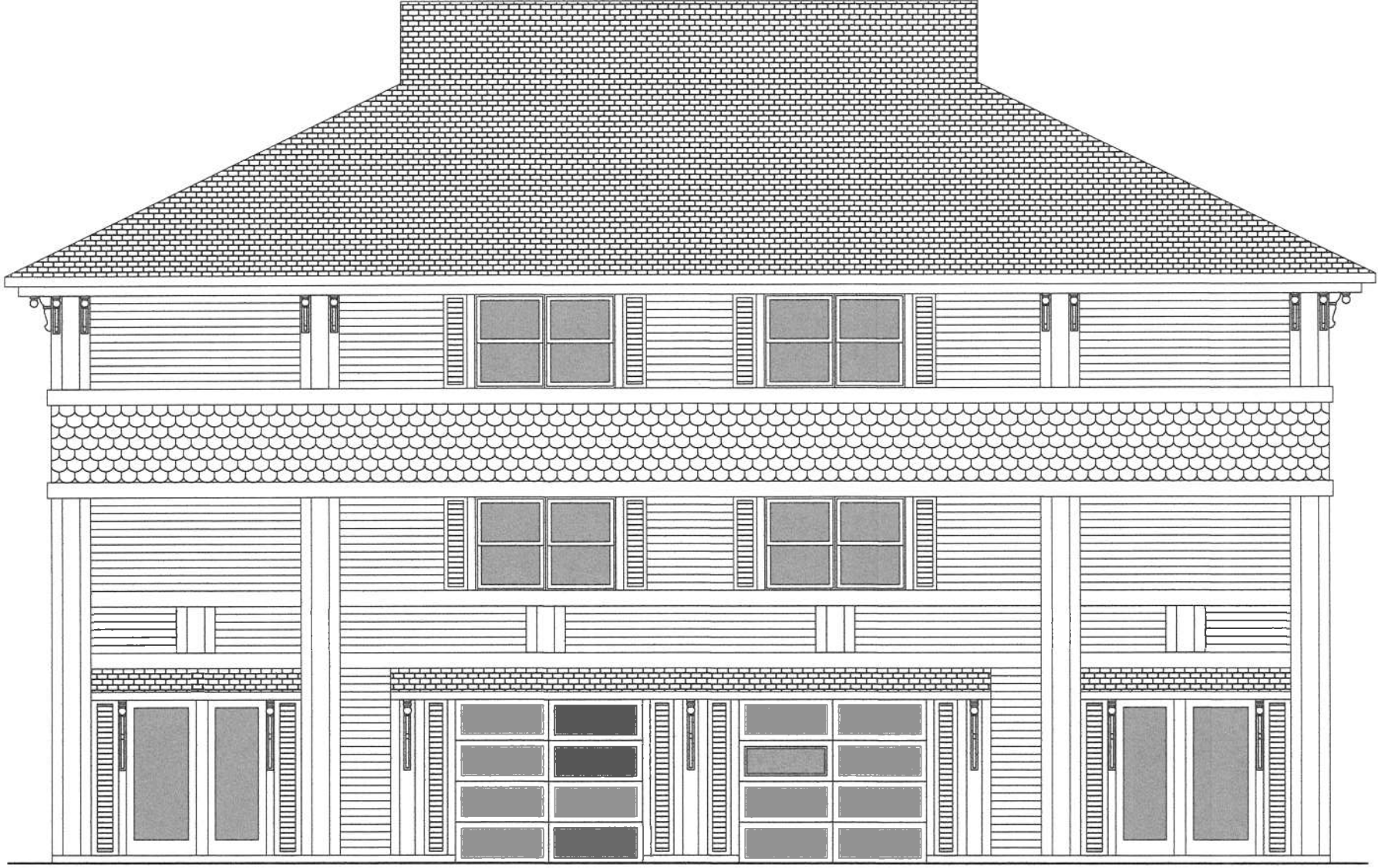
VERSION #1 FRONT ELEVATION