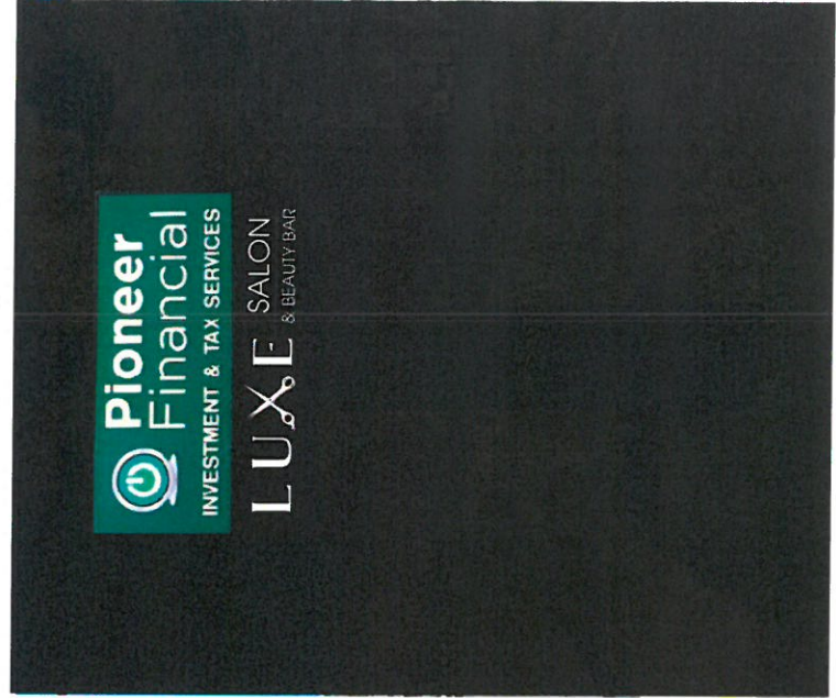
Night time view