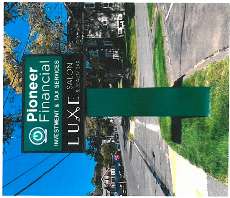
Day time view