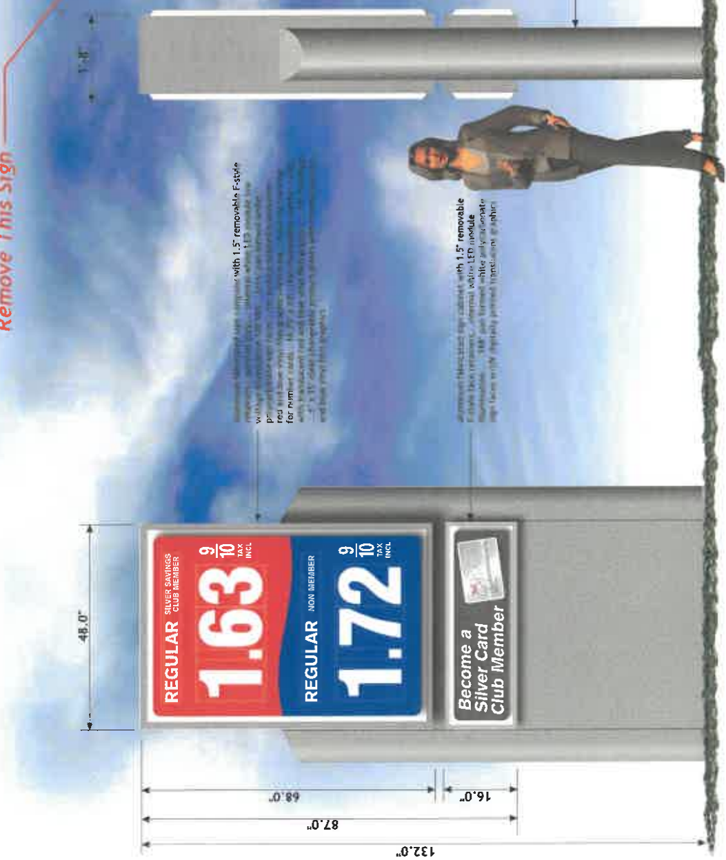
New Double Sided Internally Illuminated Price Sign....5/8"=1'-0"

ORIGINAL PERMIT # B-17-320 DATED 7-28-2017