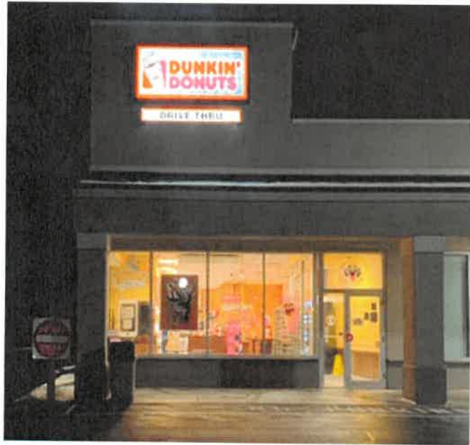
NIGHT PHOTO OF EXISTING ILLUMINATED SIGNAGE