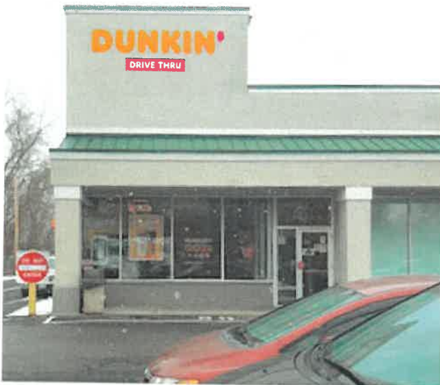
DAY PHOTO OF PROPOSED ILLUMINATED SIGNAGE