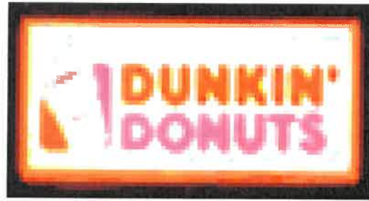
EXISTING 4FT-6IN X 9FT SIGN