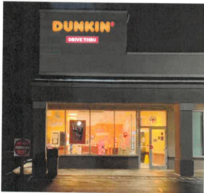
NIGHT PHOTO OF PROPOSED ILLUMINATED SIGNAGE