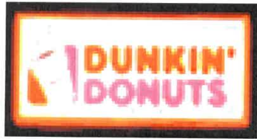
EXISTING 4FT-6IN X 9FT SIGN