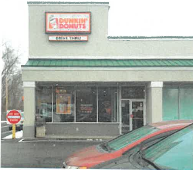
DAY PHOTO OF EXISTING ILLUMINATED SIGNAGE