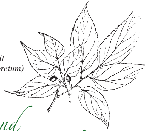
Hackberry leaves and fruit (#8 in Hahn-Warner Arboretum)